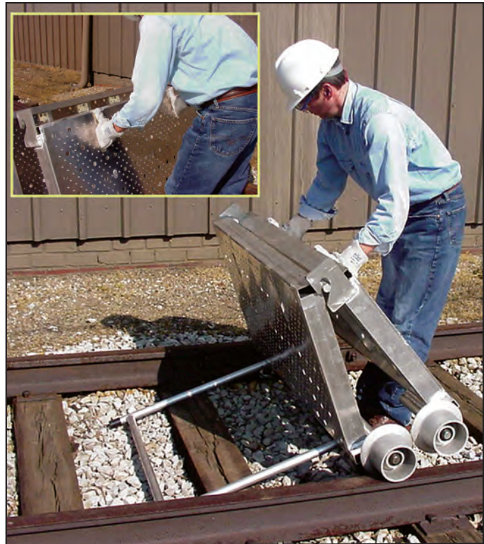
Hand holds in the ATS-1B deck make assembly easy.