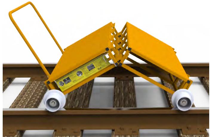
TS-4 interlocking halves