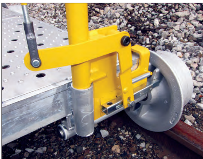
R1663 shown with ATS-2B cart