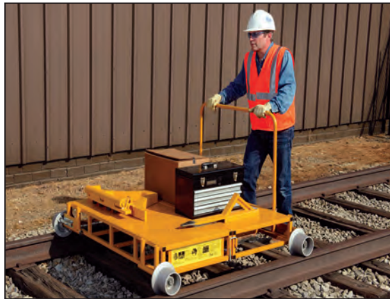
The taller handle enables heavier loads to be moved easier.