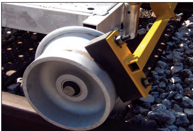
RA-1442-4 shown with ATS-2B cart